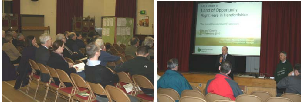
Figure 2 – Photographs of Place Shaping Public Evening Event

A Launch Event was organised for invited stakeholders at The Kindle Centre, Hereford on 18 January 2010. 1111 stakeholders were invited to view the Place Shaping exhibition, give some initial views on the Options and ask Forward Planning Officers any questions regarding the possible Options. An event was held on the 26 January at the Town Hall, Hereford which focussed specifically on the issues and options within Hereford. Also an evening public event was held at Aylestone Business and Enterprise College on 23 February 2010 which followed the same structure as the launch event.