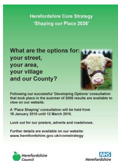
Figure 4 – 'Place Shaping' Advert