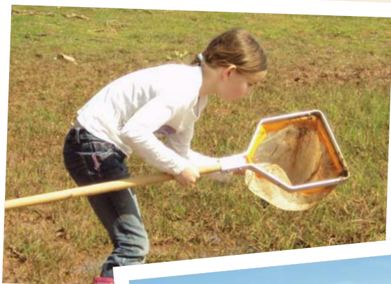
What????!!! Quick build a fence to keep it out! Forest School at Garway