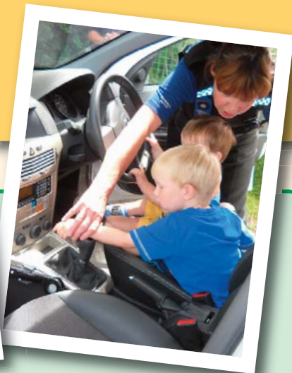
'Ello, ello - driving licence please! Child accident prevention week - Ledbury Children's centre