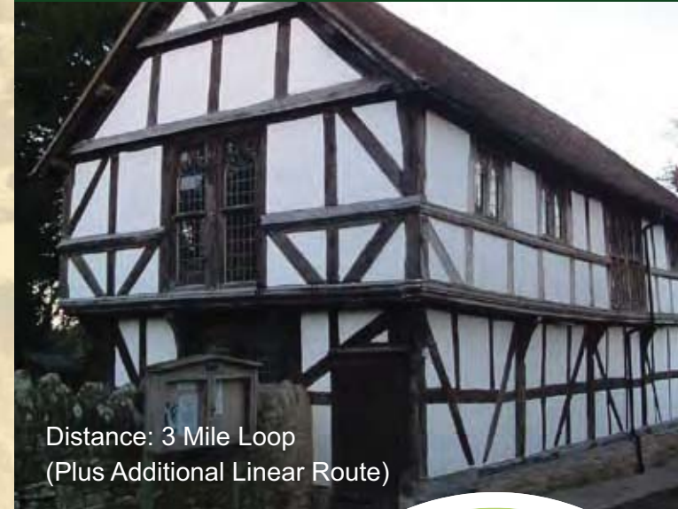
Distance: 3 Mile Loop (Plus Additional Linear Route)