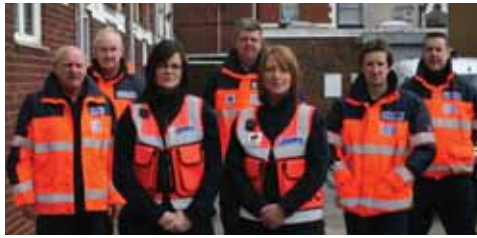
The community protection team

The council has retained weekly household waste collection services and the new wheeled bin recycling service has been well received by residents.